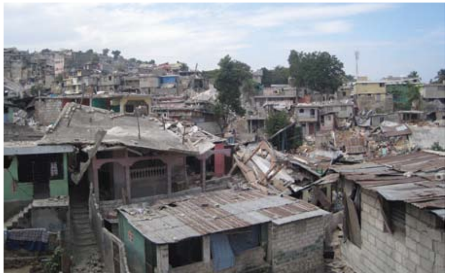
The earthquake left significant damage to many area neighborhoods.