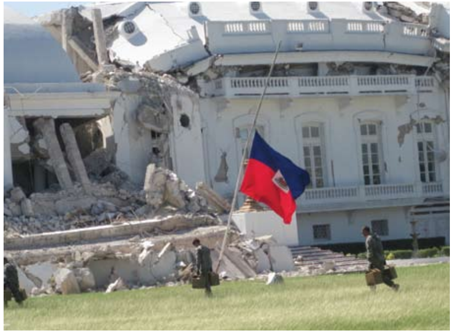
Significant damage to The Palace