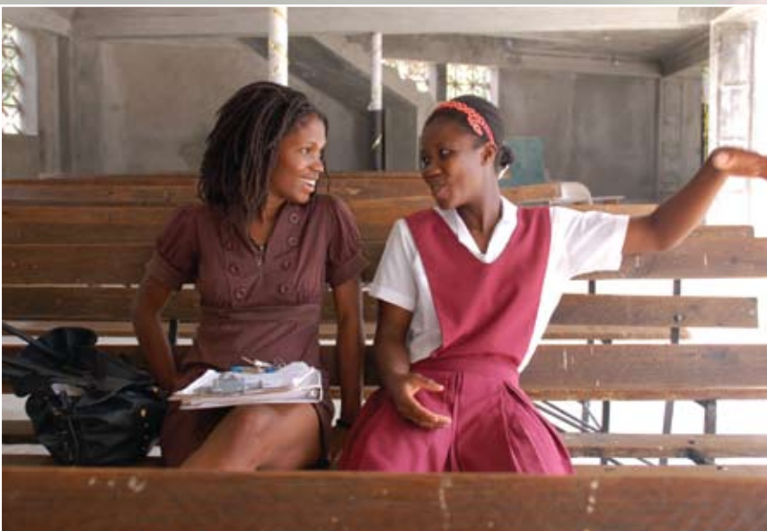
Two children from the program