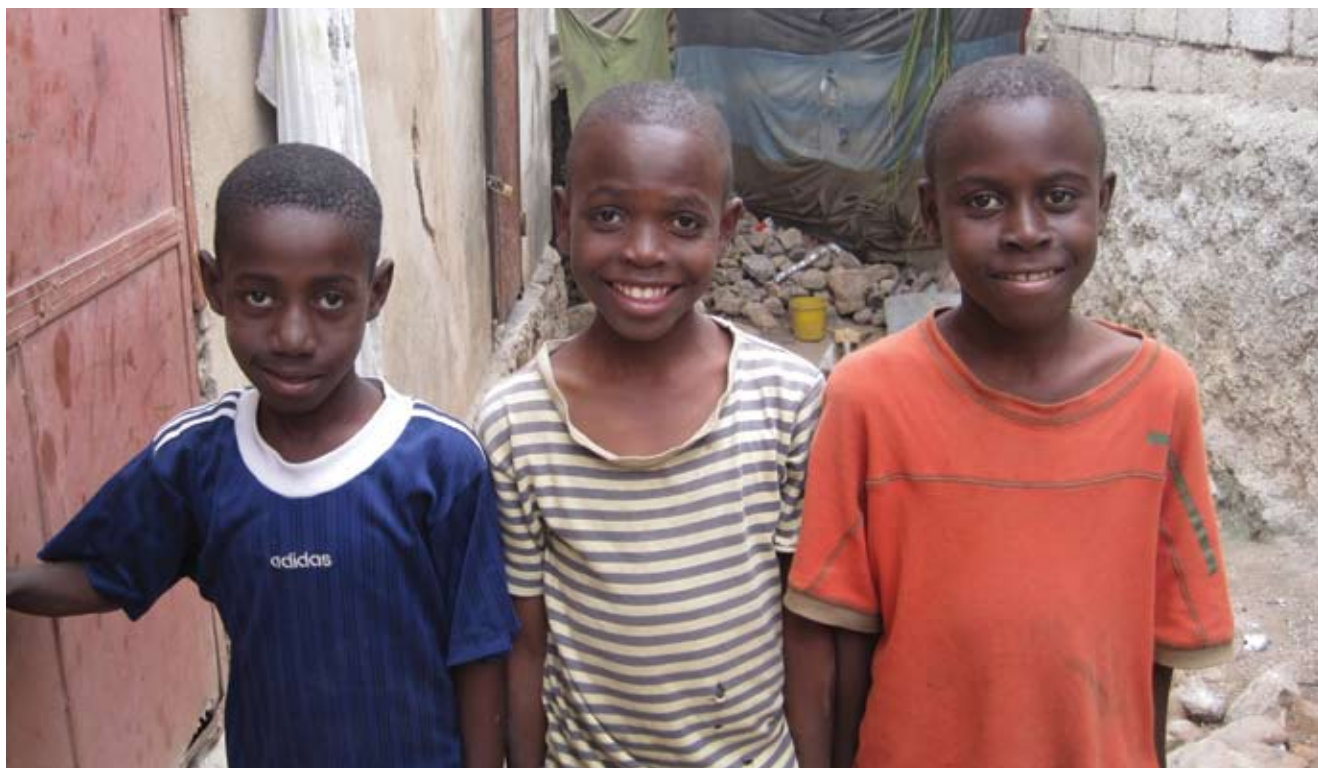
Haitian children are recovering from the devastating events.

The Foundation also partners with community leaders and other organizations to set up medical clinics, literacy programs and vocational training for adults and educational counseling on human rights for host families. This fall, the Foundation will open a transitional home to house children